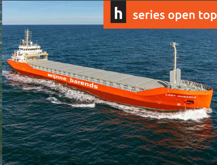
h series open top