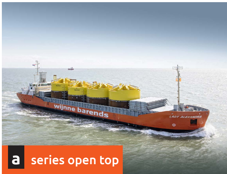
a series open top